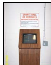
The kiosk centre in the Sports Hall of Memories will soon be replaced!

In addition to the monitor, the Society feels a visitor counter will help us get an idea of traffic flow and visitors to the exhibit. We currently have no way of tracking visitor numbers to the Sports Hall of Memories. We intend to install a small counter above one of the most popular display cases that will digitally track the number of visitors to the Hall.