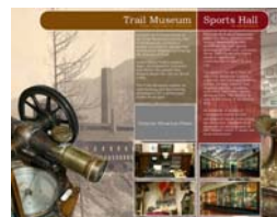
The initial brochure concept design by Glenn Schneider.

Once the layout and printing is complete, we plan to