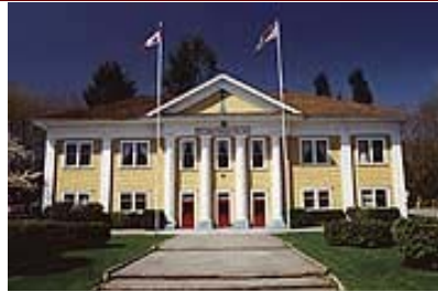
A landmark in Fort Langley, the Community Hall was completed in 1931 and is a designated "Heritage" Building

The conference was a good reminder that most, if not all, smaller archives and museums are struggling to remain active in their communities. The federal and provincial funding that was once provided to the heritage sector is no longer there and many archives and museums are