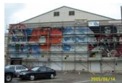
The mural as on June 14, 2005. The artists have come a long way in just one week!

The Society dug into the Archives to provide the artists with suitable images, trophies and colours in order to produce an