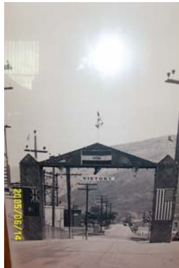
The image of the Victory Arch recently acquired by the Archives.