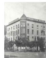
The Arlington Hotel, one of the many buildings on the historic walking tour.

Lorna Nutini and Sarah put together a guided path to follow from both the downtown and the upper West Trail areas. The downtown tour is based on the historic plaques that will soon be placed on the many historic buildings downtown. Other walks include a nature walk,