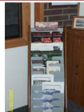
Our stand is currently located in the lobby of City Hall.

With these donations, the Society purchased a portable display stand that now