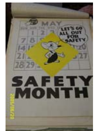
A sample of one of the Joe Cushner safety posters.

They also announce the many safety competitions once held in the Cominco Arena.