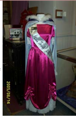
The Queen's gown now on display in the museum. Other artifacts include crowns and photos.

Sarah have finished the spring cleaning in the Museum and also made some room for a few new exhibits. Currently in the