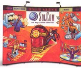
An example of what our display unit will resemble. Brochure pockets are to be added to the front.

Representatives from the 3 organizations recently met to develop the conceptual design and Frank Communications of Salmo and Calgary will prepare the artwork. We recently sat down on a confer-